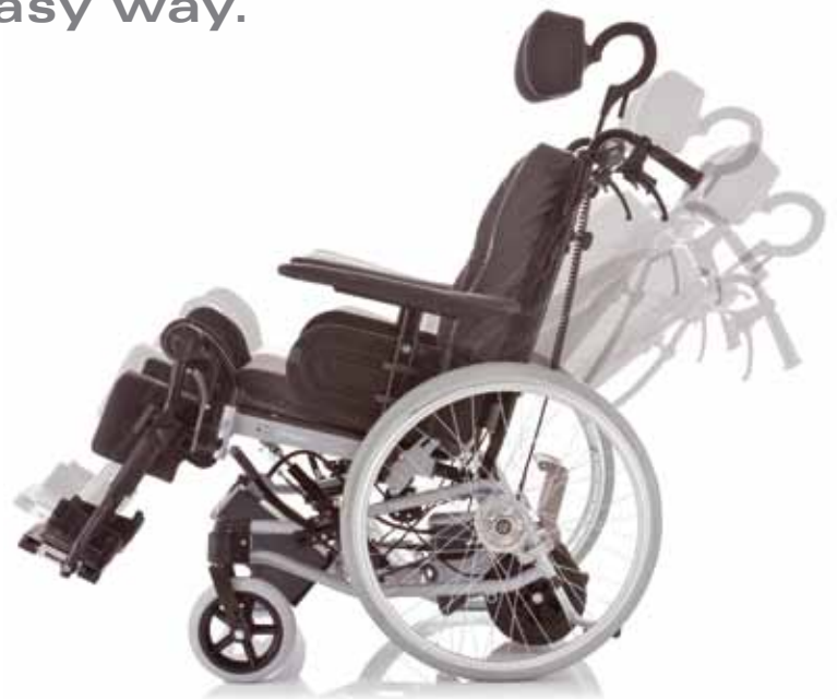
viaplus with differing backrest inclinations

viaplus is also used in residential homes. With it, pushing the wheelchairs becomes an effortless task and lightens the load for the staff.