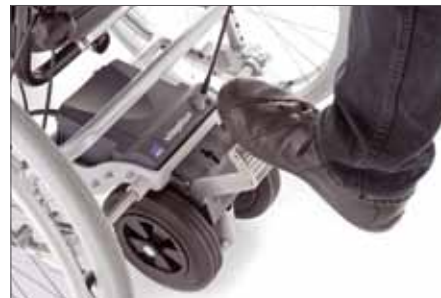
Disengaging the drive unit

The handy controls of the viaplus fit onto the handle of the wheelchair without impeding the use of the wheelchair's functions. The wheelchair is propelled forwards by light thumb pressure on the operating lever, making fatigue-free operation possible even on longer journeys. The chair is put into reverse by pulling the operating lever upwards. And for indoor manoeuvring without the aid of the viaplus, the drive wheels can simply be raised by pushing down on the pedal.