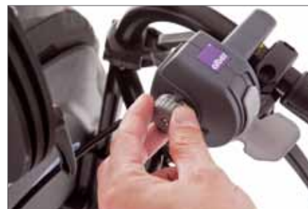
On/Off and speed adjustment

The wheelchair's functions are all clearly marked on a handy, non-slip grip control knob that can be operated with just one hand – for easiest possible use from the word go. The rechargeable battery of the viaplus is mounted inconspicuously below the seat of the wheelchair and is powerful enough for even long walks. It can be quickly and easily recharged using the battery charger supplied with it.