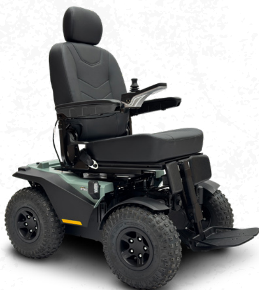
Outback with Contoured seating and Q-Logic 3e controller